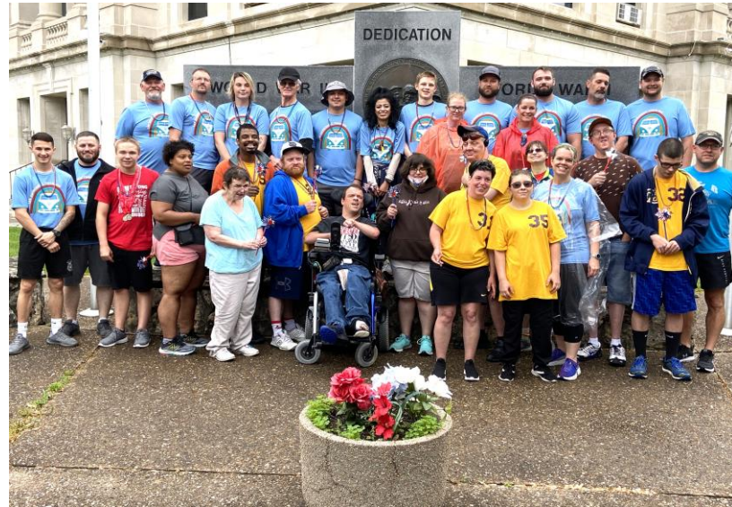
Above: The 2021 NECC Torch Run draws a big crowd at the Pike County Courthouse

One of the routes includes Bowling Green, sponsored by the Northeast Missouri Correctional Center and local law enforcement. The event will get underway May 25 th